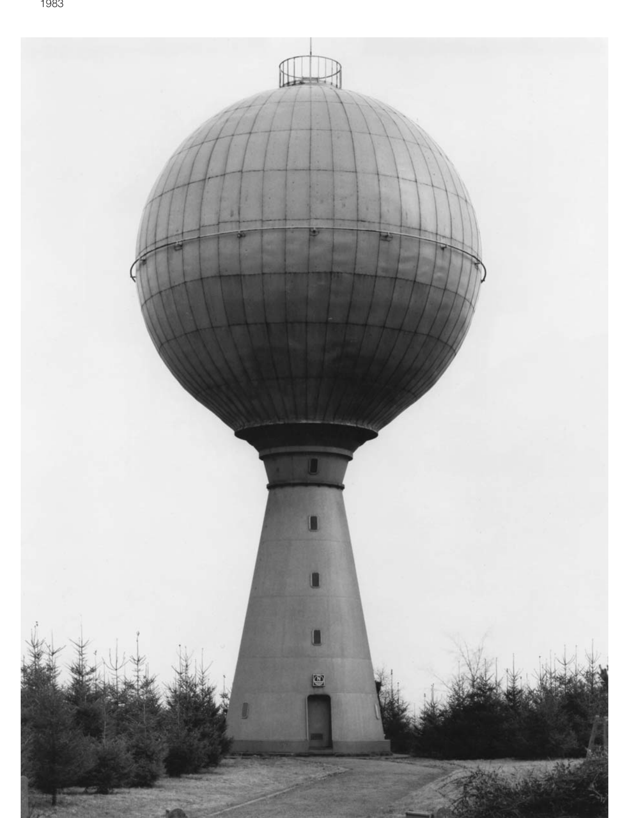
Bernd and Hilla Becher Water Towers, Verviers, Belgium,